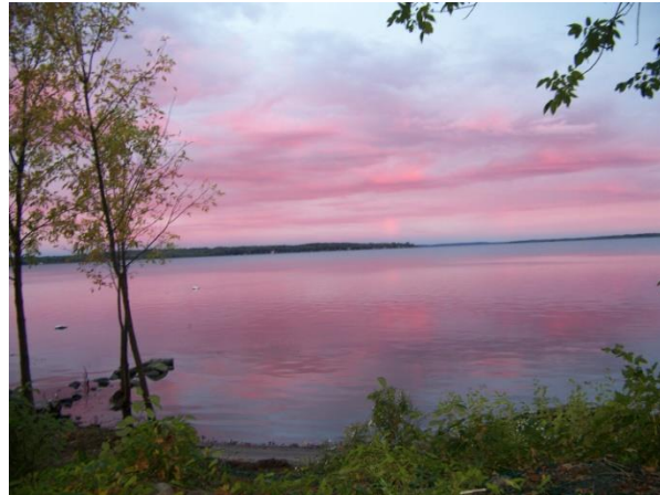
Sunset September 25 th , 2016, 7 pm (52 Lawson Lane) Sunrise September 26 th , 2016, 7 am I found this amazing as both are looking west from almost the same location

Well , another year is quickly winding down, including in Talpines country. A check on things after the 3 day wind storm in mid November found very few trees or branches damaged but numerous twigs fell and mounds of weeds washed onto our eastern shore! As well, the spray of water from the waves had frozen high up on the trees and onto lawns and decks.