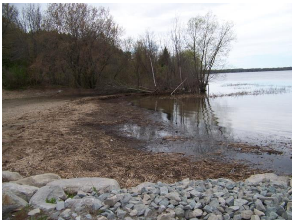
Same as above but it is May 2017 ... no leaves, no green grass, no sunset, no blue sky.