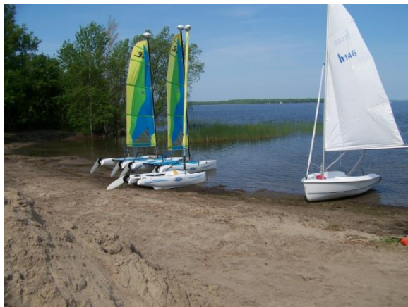
End of May 2016, Pine Street Beach

Well, it's finally cottage season again. Now, if we can only convince the weatherman to cooperate with some summer like temperatures and sunshine. Our Newsletter is a little ahead of schedule as our AGM is coming up shortly and we want to bring you up to date with some of the things going on in the early part of our Canada 150 Celebrations.