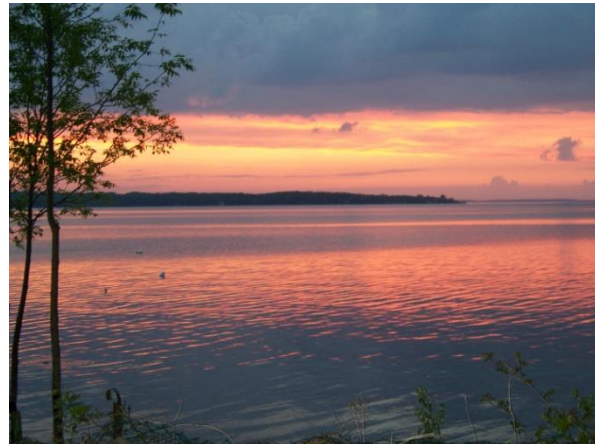
Sunset end of May 2016, Sturgeon Bay