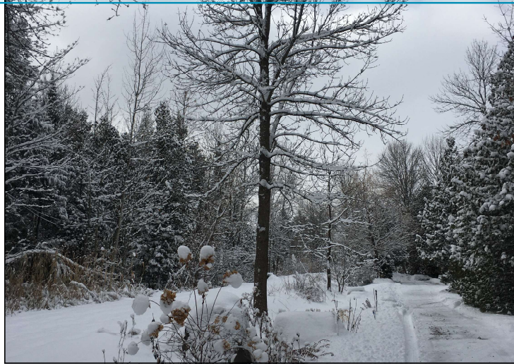
Snowy Tay Trail near Old Cottage Lane, Waubaushene

Hi Folks! Hope you're holding up well despite the weather, SPRING WILL COME. We're sure of it. 😊 We can't wait to see everyone again. WELCOME