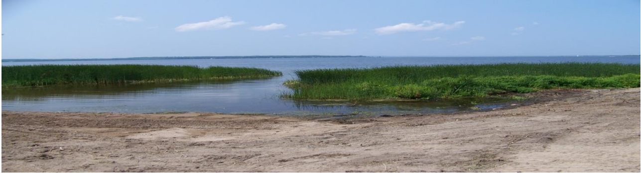
Pine Street Beach after improvements in 2014.

Waubaushe has seen several sidewalks re-done this summer. Other construction of note is the beginning of renovations to the Duck Bay road bridge. Pier work is to begin this year and the next phase will see it replaced to be able to withstand more serviceable load limits. Plans are (due to costs) that it will still be a one lane structure. As well, word is out that next year, Pine Street will be re-done from approximately the Gazebo Park to the Fire Hall.