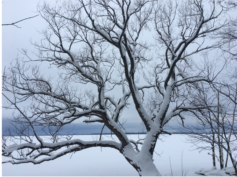
Looking through the old willow over the snowy Bay, Waubaushene Jan 2021